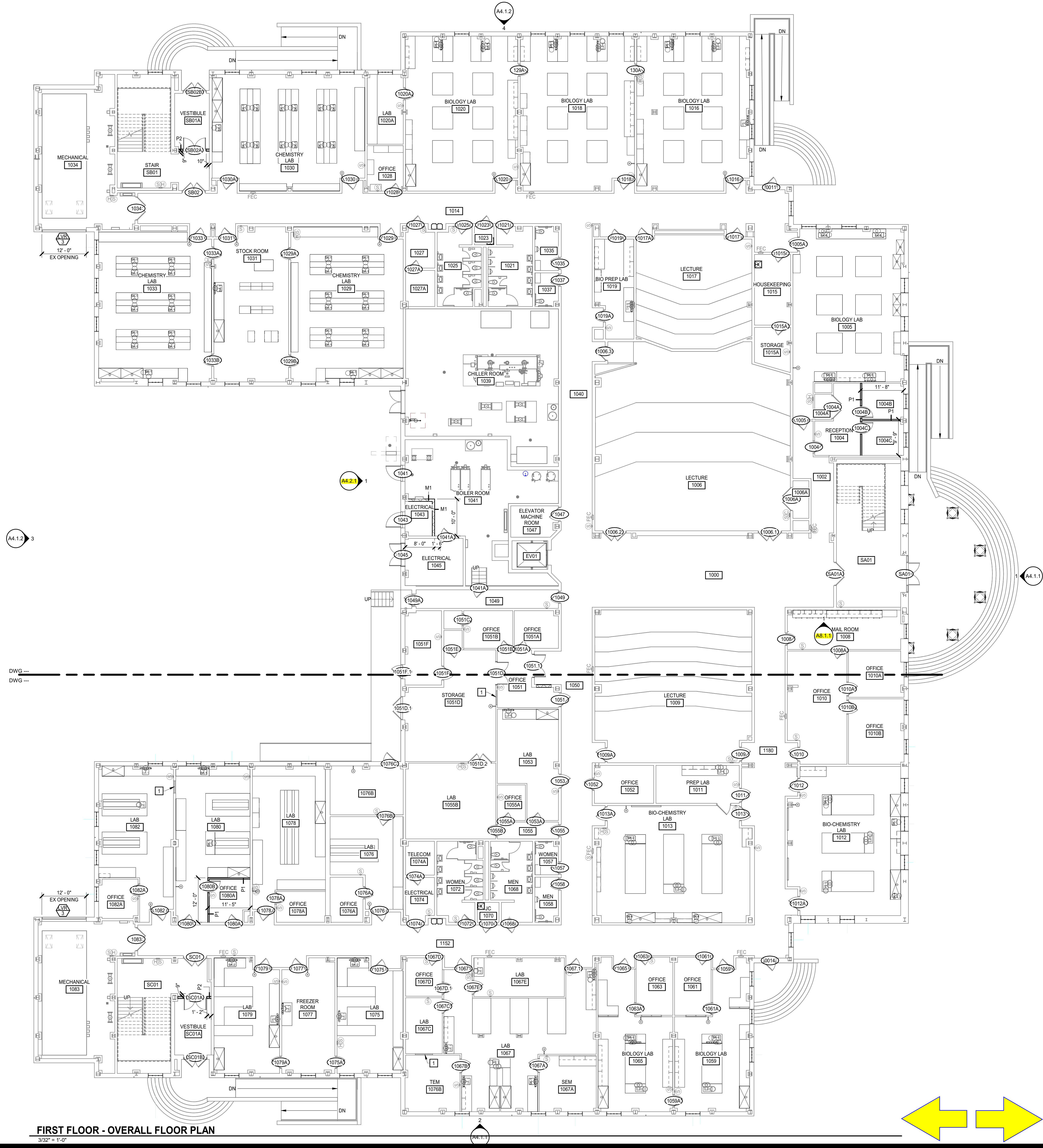
FIRST FLOOR - OVERALL FLOOR PLAN 3/32" = 1'-0"